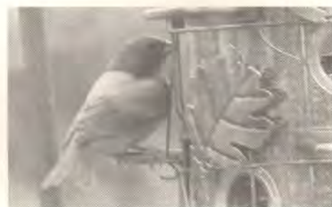
This adult male Painted Bunting was on Lambert Trail in Chesapeake, Va..