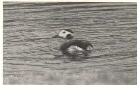
This female Long-tailed Duck was one of two found on 16 Feb on the salt ponds of Saltville in Smyth Count.