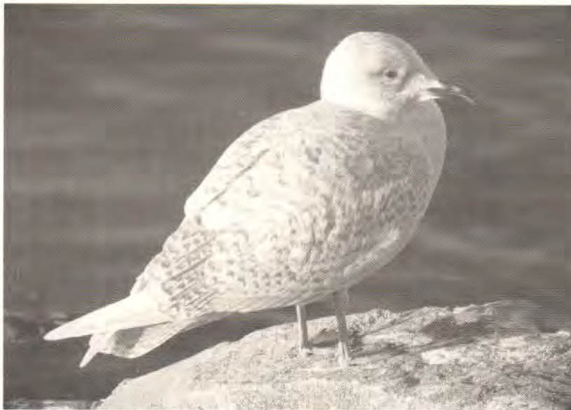
This Juvenile Iceland Gull on island 4 of the CBBT was digiscoped by Adam D'Onofrio using a Swarovski ATS 65 HD spotting scope and a Canon Powershot G5 digital camera. on 12/04/04.

the third highest count in the 40 years of the CCCBC. At Willis Wharf, Northampton 150+ Marbled Godwits were counted on 13 Feb (VK), with 197 there on 21 Feb along with 325 Willetts (HA). A Long-billed Dowitcher was reported 29 Dec during the ChCBC. A Pomarine Jaeger was recorded 26 Dec CBCBC. The last reports of Laughing Gulls were of 6 NNCBC 18 Dec and at least 4 in a large gull flock on the Nansemond R. Suffolk 21 Dec (LW). A Black-headed Gull was discovered at Lynnhaven Inlet, Virginia Beach 25 Feb (RF) and found again 27 Feb (ph. JF). Thousands of Bonaparte's Gulls appeared along the CBBT 12 Dec ( vide NB) and hundreds were still being seen there 2 Jan (SH, RD, BT) and 21 Jan (RA). A MEW GULL ♀ was identified during the BBCBC 29 Dec (PS). If submitted and verified, it would become the third accepted record for Virginia. Lesser Black-backed Gulls continue to occur in large numbers at Back Bay with 65 on 7 Dec (DS), 76 on 29 Dec during the BBCBC, and 45 on 17 Feb (RA, DS). Away from the coast 16 Lesser Black-backed Gulls were recorded 2 Jan NaCBC. Two Glaucous Gulls were observed; one a second-winter bird was on pilings in