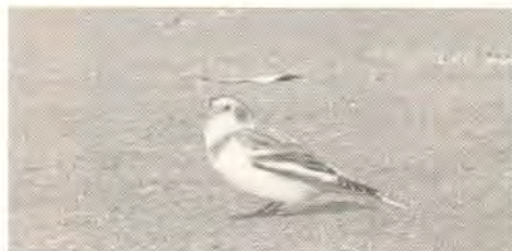
This is one of 3 Snow Buntings seen at First Landing State Park during the Little Creek CBC 12/31/04.