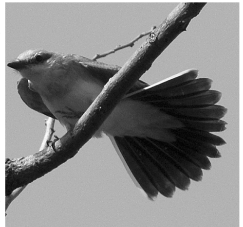
Western Kingbird at Washington’s Birthplace 14 September

Nov (AB, G&RH, TS). Two late Marsh Wrens were seen 17 Nov Hughlett (FD) and one was at Mulberry 28 Nov (FA). Eastern Bluebirds had a very successful breeding season at King Carter Golf Course near Kilmarnock, Lancaster , From 33 nest boxes 207 bluebirds were fledged (up from 121 in 2007), as well as a family of Tree Swallows and another of chickadees. A Nor’easter in May killed three broods and House Sparrows killed three adult bluebirds and injured one, but very conscientious trail maintenance prevented house sparrows from raising any young (T&ET). The first Hermit Thrush of the season was at Beaverdam 14 Oct (G&RH). Beaverdam was also a good spot for other thrushes this year: six Swainson’s Thrushes were seen there in four visits 22 Sep to 31 Oct, and a late Gray-cheeked Thrush was present 31 Oct (G&RH). Another gray-cheeked was at White Marsh, Gloucester 5 Oct (H&JW). American Robins flocked to Riverwood along the upper Mattaponi R 28 Nov where 740 of them gobbled up the abundant holly berries (FA). One can always expect Brown-headed Nuthatches at Bethel, but the 21 seen there 29 Sep was the highest the editor has on record (G&RH). White-breasted Nuthatch is uncommon in the eastern extremities of these peninsulas but two were at Bethel 29 Sep (G&RH) and one was in