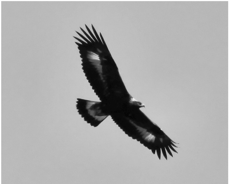
Les Brooks found and photographed this Golden Eagle at Chincoteague.

ing on Berkley Avenue Extension, Norfolk and recovered by Norfolk Animal Rescue who responded to the driver's call. A Short-eared Owl was at Bull's Landing, Northampton 7 Nov (BA vide HA). The 15 th annual CCB lower Northampton Northern Saw-whet Owl migration study commenced 25 Oct. Through 30 Nov total captures included 55 new individuals plus 8 banded elsewhere, one of which was from Prince Edward Island, Canada (SE). A Northern Saw-whet Owl banded in lower Northampton in 2007 was caught on Prince Edward Island in 2008. Common Nighthawk reports included five in Norfolk 12 Sep (NF), and two at KSP 27 Sep (HA). A Ruby-throated Hummingbird was present in the Lake Smith area of Virginia Beach 8 Nov-30 Nov (DS). A Chuck-will's Widow was banded at KSP 16 Sep (JR) and a Whip-poor-will was singing there 28 & 29 Sep (JR). A high volume Northern Flicker movement brought 1512 past the KHW 30 Sep (HA).