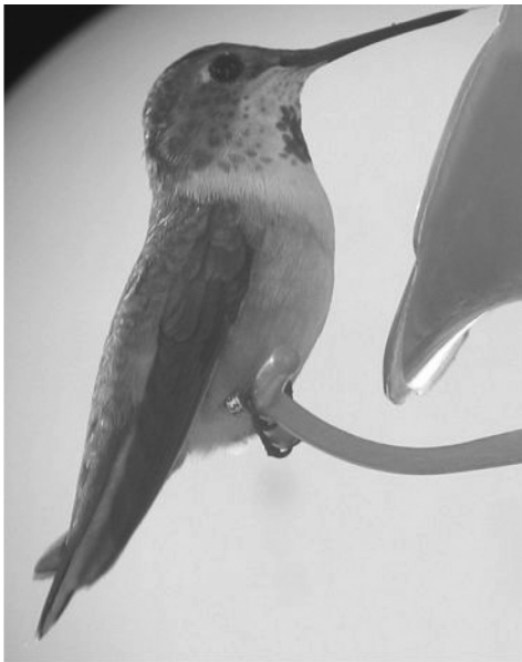
Adam D'Onofrio photographed this Selasphorus hummingbird in Dinwiddie.

Sep, and 1 Oct (RM). A Baywood farm in Grayson furnished the FOS Lincoln's Sparrow 6 Oct (MD), and the FOS Fox Sparrow and White-throated Sparrow for Russell came to a feeder near Lebanon 29 Oct (JT). Washington's FOS Fox Sparrow was observed in Bristol 23 Nov (RH). A feeder at Independence in Grayson had an unprecedented 6 Fox Sparrows 30 Nov (SJR). The FOS White-throated Sparrow for Buchanan was found on Compton Mt 30 Sep (RM). The FOS White-throated and White-crowned Sparrows for Grayson appeared near Galax 14 Oct (B&MD). The FOS White-crowned Sparrow in Buchanan was discovered 11 Oct near Weller Yard west of Grundy (ETIII). A female Blue Grosbeak was found in a garden at Baywood 31 Aug (MD). More than a dozen Rusty Blackbirds were observed in Independence, Grayson 23 Nov (SJR). Two Purple Finches came to a feeder in Abingdon, Washington 29 Nov (EM) and two Pine Siskins were at the same location 30 Nov (EM). The FOS Pine Siskins reported in Grayson were observed at Independence 27 Nov (SJR). The FOS Pine Siskins in Buchanan came to a feeder on Compton Mt. 19 Oct (RM).