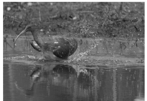
Immature White Ibis found 30 July in Leedstown.

Single American Oystercatchers were noted at Hughlett 15 Jun and 13 Jul (TS), Bethel 27 Jul (G&RH), and at Gwynn's 20 Jun (BW, et al), and 10 were at Haven Beach Mathews 10 Jul (CS). A beautiful female American Avocet was photographed at Hughlett 6 Jul (TS). Quite a few migrating shorebirds were present at