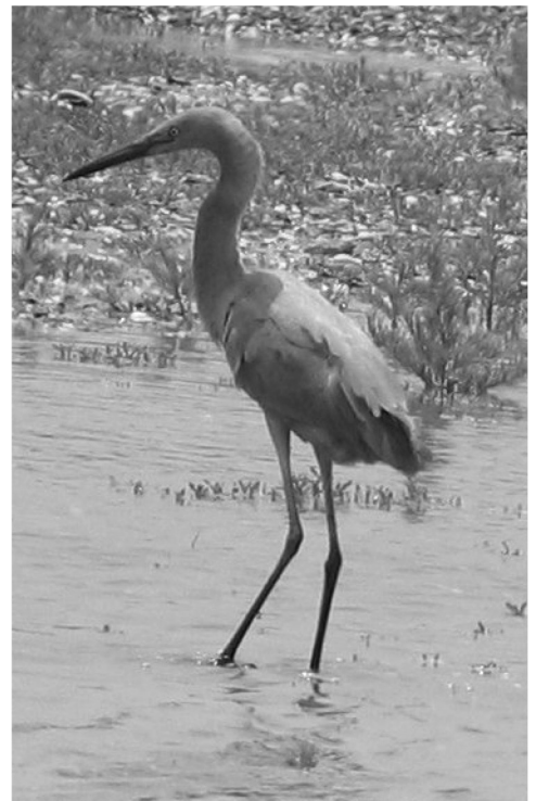
This Reddish Egret, the state’s fourth, was at Craney Island July 22–24, 2008.

Well ahead of the species more normal mid-Jul arrival was 2 Black Terns at Chinc. 29 Jun (ML). Up to 6 Monk Parakeets were observed at the Stonybrook, Newport News site 24 Jun (BW). From one to 4 Common Nighthawks were observed at Craney 12 Jun–22 July (BW, SD, A&SK, AM). A Saltmarsh Sharp-tailed Sparrow was at South Point Marsh, Accomack 28 Jul (HA).