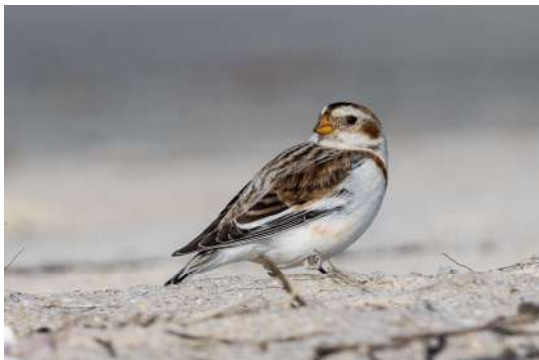
Larry D. Tipton's photo of a Snow Bunting at Bethel Beach NAP in Mathews , taken on 24 Jan.

birds. Tying the previous winter high, 3 Sedge Wrens were found at a foggy Bethel 31 Dec (JoC, MC). Guinea Marshes, Gloucester 9 Jan (MN, WBU) and Bethel 27 Dec (RB) each hosted 5 Marsh Wrens , just shy of the winter high of 6. The poor production of cedar fruits this winter appeared to influence the numbers of several species. The high count of Hermit Thrushes is often over 20, and the all-time winter high is 39. But this year the high count was only 7 at a private tree farm near Oak Grove, Westmoreland (WBCBC). Counts of over 1000 American Robins are common some winters and the all-time winter high is 23,500. This winter, there were only nine reports of over 100, and the high was a mere 397 near Nomini Cr., Westmoreland 8 Feb (MG). Along with those robins was the season's high of only 43 Cedar Waxwings . This was the lowest winter high since the winter of 2016-17 when the high was only 25. The all-time winter high is 410, and normally, counts of over 100 are common, but this year there were only