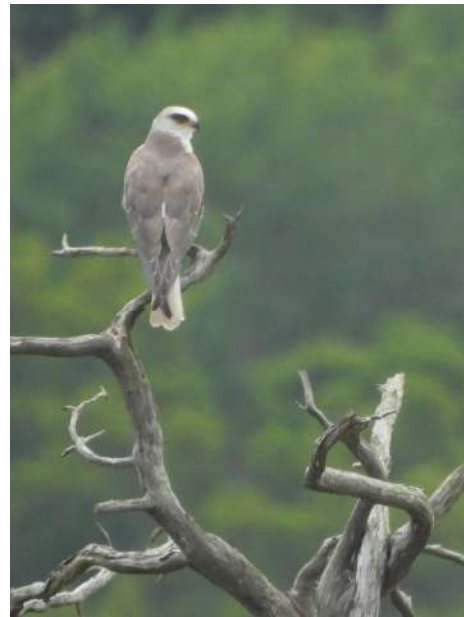
Mike Epler's photograph of a White-tailed Kite , spotted at Eastern Shore of Virginia NWR in Northampton on 13 May.

Always a sought-after migrant in the Coastal Region, an Olive-sided Flycatcher was a welcome find at Back Bay 21 May (ph. RB); this species is detected less than annually in Virginia Beach despite heavy birder coverage. The only COMMON RAVEN report from the Region was one at what is now a regular location along Interstate 64 near Newport News Pk., Newport News 8 Mar (JB). A single Red Crossbill spotted atop a pine at the Chincoteague Is. Nature Trail, Accomack 28 Apr (TM) was a good find, particularly given the lack of any movement by this species into the Coastal Region in the