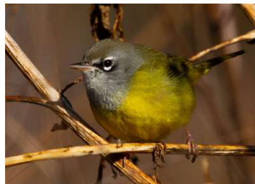
Diane Lepkowski's photograph of a MacGillivray's Warbler from L. Shenandoah in Rockingham , 20 Dec.

Single Olive-sided Flycatchers were seen at Forks of Water, Highland 16 May (RM); Second Mt. Farm near Rawley Springs, Rockingham 18 May (ph. TE); and at the Arcadia Boat Ramp, Botetourt (ph. BE). Alder Flycatchers returned to their traditional breeding location at Straight Fork, Highland 7 May (ES, TS) and were reported there through the end of the period. There were two additional reports: a presumed migrant at the VT Vet School Pond 14 May (ph. BB) and another possible breeder on Middlebrook Rd. in Newport, Augusta first seen