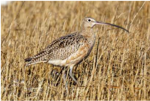
Timothy Burnett's photograph of a Long-billed Curlew at Gull Marsh in Northampton , 30 Dec.

Queen Sound Landing, Accomack until 28 Mar (ph. DCh, ph. DW), while a second was a one-day wonder at 11 th St. Beach Access, Norfolk 13 Apr (ph. VC, ph. DCI). Rounding out the grebes, the rarest of the spring was a Western Grebe off Back Bay 6 Mar (RLA, DCI, SK, LMo). Presumably the same individual was seen again at the same location 17 Apr (ph. SMy, AM). A long-staying White-winged Dove at a private yard on River Rd., Newport News remained from the winter through 5 Apr (ph. PVV). Typically one of our rarer migrants, Black-billed Cuckoos had a good showing this year with four reports. Two came from the Suffolk side of Dismal, where one was recorded at Railroad Ditch 27 Apr (a. r. anonymous eBirder) and another was seen at