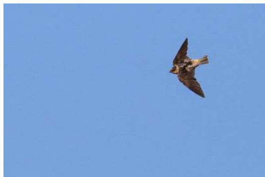
Mike Collins's picture of a Cave Swallow at Pleasure House Pt. Natural Area in Virginia Beach , 1 Dec.

Warblers this winter: one at a residence in the Laurel Manor neighborhood of Virginia Beach 11 Dec (ph. TMa); another at Pickett's Harbor NAP during the CCCBC (EO); and one at the end of 25 th St., Virginia Beach 16 Jan (ph. SH). A Northern Parula at Back Bay 2 Dec (SM, AMy) was notably late, but one at First Landing SP, Virginia Beach 21 Feb (BS) was even more notable given the likelihood that it overwintered. Western Tanagers were well-represented in Virginia Beach this winter, with reports from four separate locations: the retention pond behind the